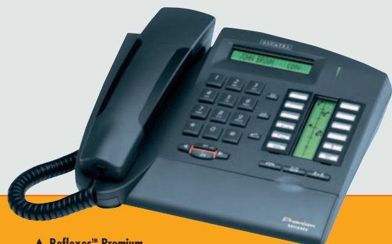
▲ Reflexes™ Premium